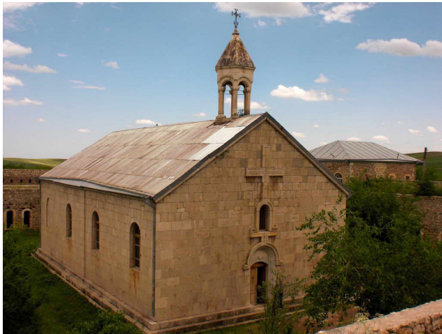
Amaras Monastery, Artsakh/ Nagorno-Karabakh, 4 th c. A.D.

The Amaras Monastery holds tremendous cultural, historical, and religious value for a plethora of reasons. This ancient monastery was built in the fourth century A.D. by Saint Gregory the Illuminator, who is responsible for establishing Christianity as the official religion in Armenia. Mesrop Mashtots—the creator of the Armenian alphabet in the fifth century—founded the first school within the monastery that would utilize the new and enduring alphabet.