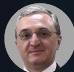
ZOHRAB MNATSAKANYAN Political Dynamics in the Multilateral System and Its Institutions Yerevan, Armenia